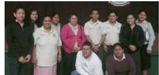
TEACHERS PREPARING TO GO TO MINISTRY OF EDUCATION

Today (Wednesday - May 26th), our teachers went to the Managua to vocally protest their "No Pay" dilemma. Heavy rains kept them from going for several hours, but they remained determined. When the rain finally slowed down, they went and made their stand at the Ministry of Education!